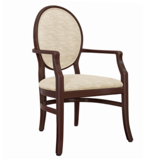
Model: 2054D 23.5W 26.5D 39H 20.5SW 19SD 19SH 25.5AH

The stylish San Michelle collection suggests the ultimate in refined elegance. The collection's richly detailed legs, curved arms and graceful dimensions offer absolute comfort in both dining and lounge and lobby settings. Available with and without arms.